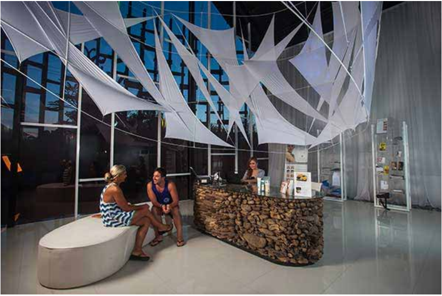
Cocoon Medical Spa, Legian