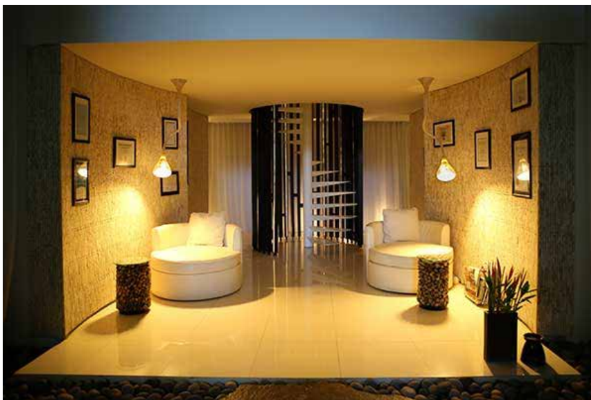
Cocoon Medical Spa, Legian