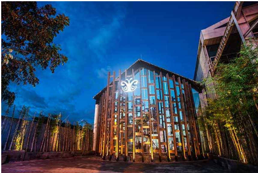
Cocoon Medical Spa, Legian