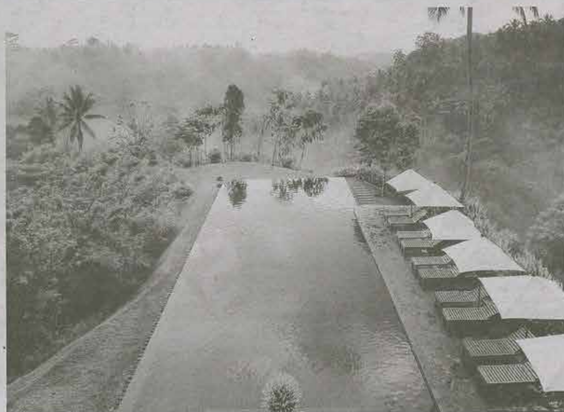
CHILL ZONES: (clockwise from main) Spectacular setting of the Rock Bar at Ayana Resort; relaxing vibe at Betelnut Cafe; Allia Ubud resort pool; tempting presentation at Milk & Madu; and it doesn't get much closer to the water than Finn's Beach Club.