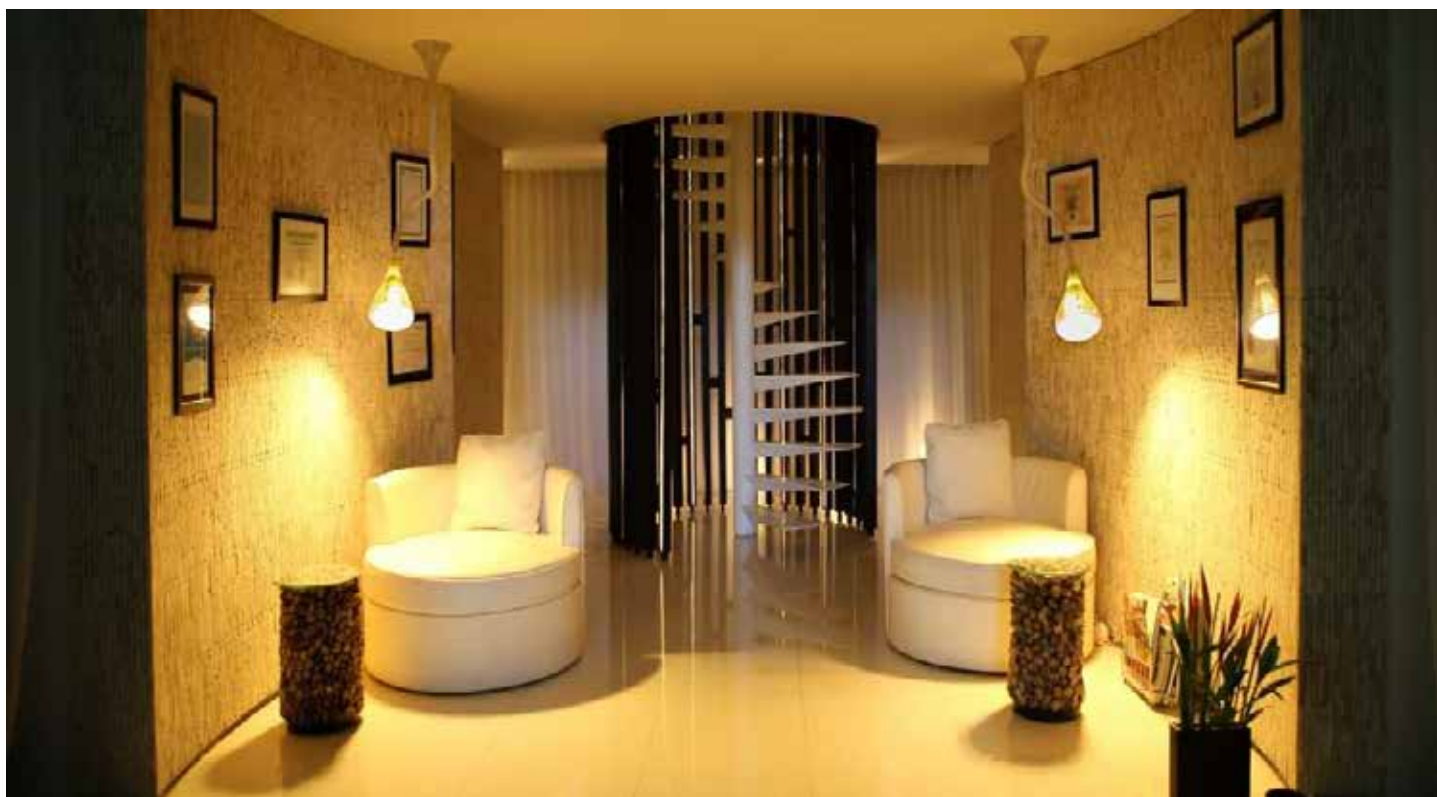
Cocoon Medical Spa Legian waiting room

If you wear makeup for long hours everyday like I do, I'm gonna tell you now that no amount of DIY facial masks on your self-care Sundays is going to really brighten up the boring, dull complexion on your face. On top of the occasional acne breakouts induced by stress and pollution (which I hide with makeup), I learnt that this seemingly "dull complexion" is actually caused by YEARS of dead skin cells build up on the top layer of our face. While my combination skin is fortunately low-maintenance, I would have never reckoned it's potential until I was introduced to microdermabrasion.