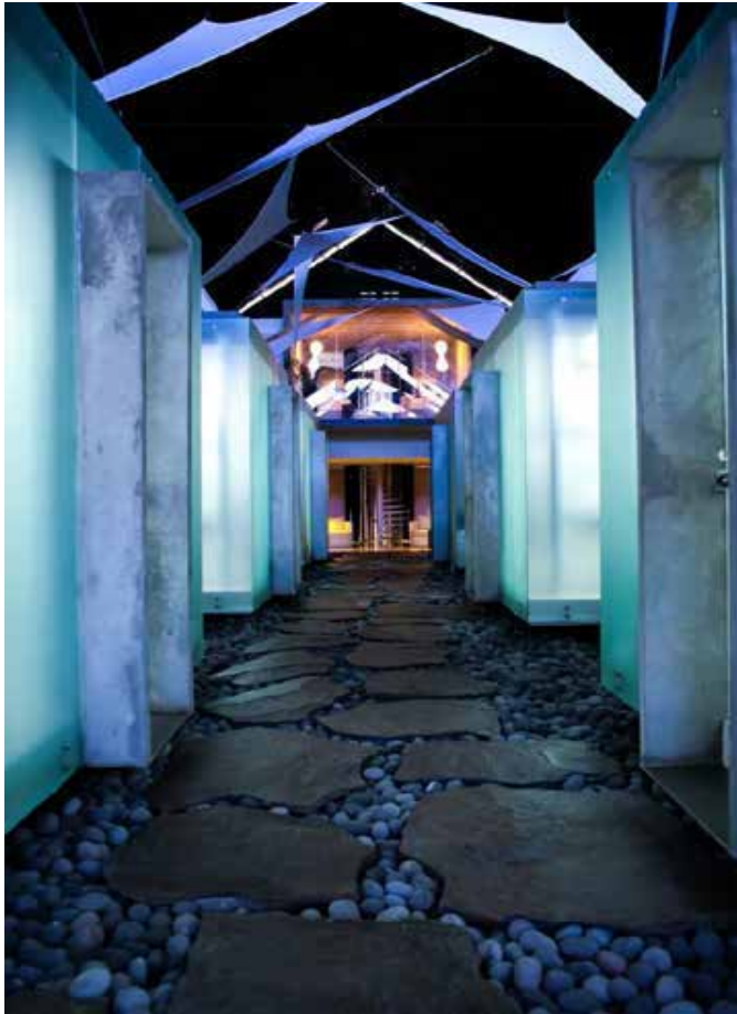
Cocoon Medical Spa Legian hallway